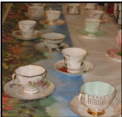
Delicate teacups and saucers stood in a lovely arrangement ready for use.