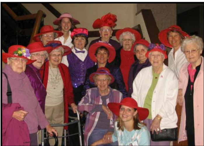
The Red Hat ladies and Life Enrichment/Wellness staff at the Raddison Hotel for lunch.